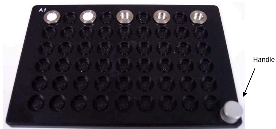
Figure 2 Powder Sampling Accessory

The powder holder accessory (part number L1320280) has a baseplate that contains a 6 x 9 array of wells. Each well can contain one powder sample cup.