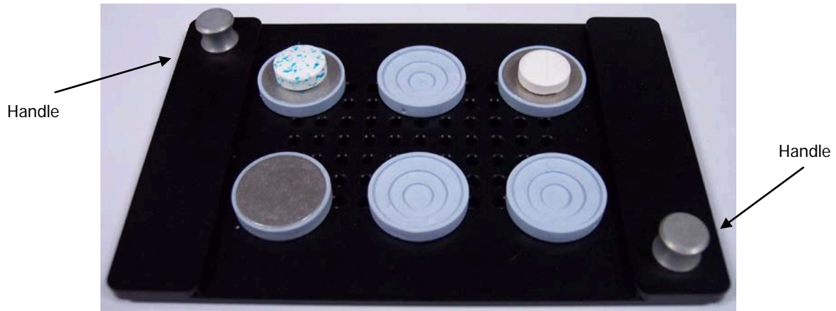
Figure 1 Tablet Sampling Accessory

NOTE: You may find it convenient to remove the handles from the accessory as this will help avoid damage to the camera snout. If you choose not to remove the handles, you should take particular care when loading and unloading the accessory to and from the instrument.